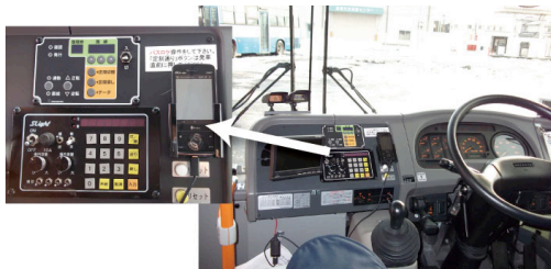
Figure 1. A smartphone on the dashboard.

As a preliminary experiment, we developed an application for smartphones, and conducted the experiment on the buses in service in cooperation with bus companies in Tottori Prefecture, Japan. As the aim of the experiment was to demonstrate the mechanism to match locations to the timetable of the bus, we settled the smartphone on the dashboard of the buses (Figure 1), and asked the drivers to operate the smartphone when he/she starts the bus. We conducted the experiment for two months since December 2010 with 70 smartphones.